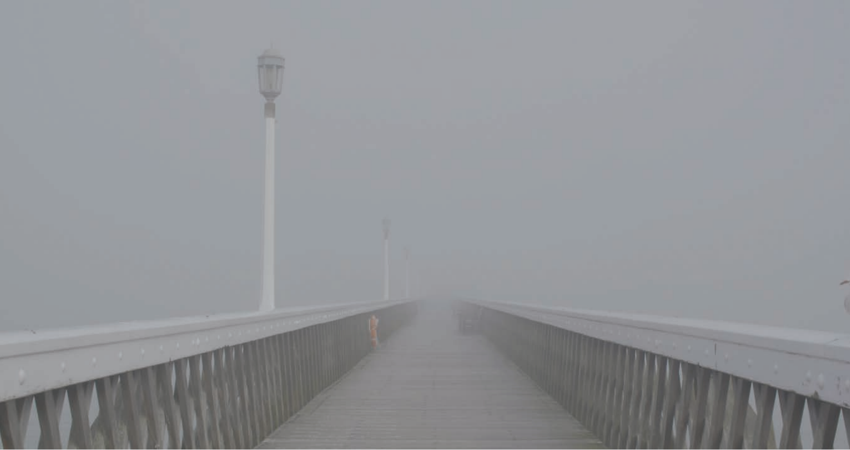
Steven Eastwood, Island (film still), 2017. 92 minutes. COURTESY THE ARTIST.