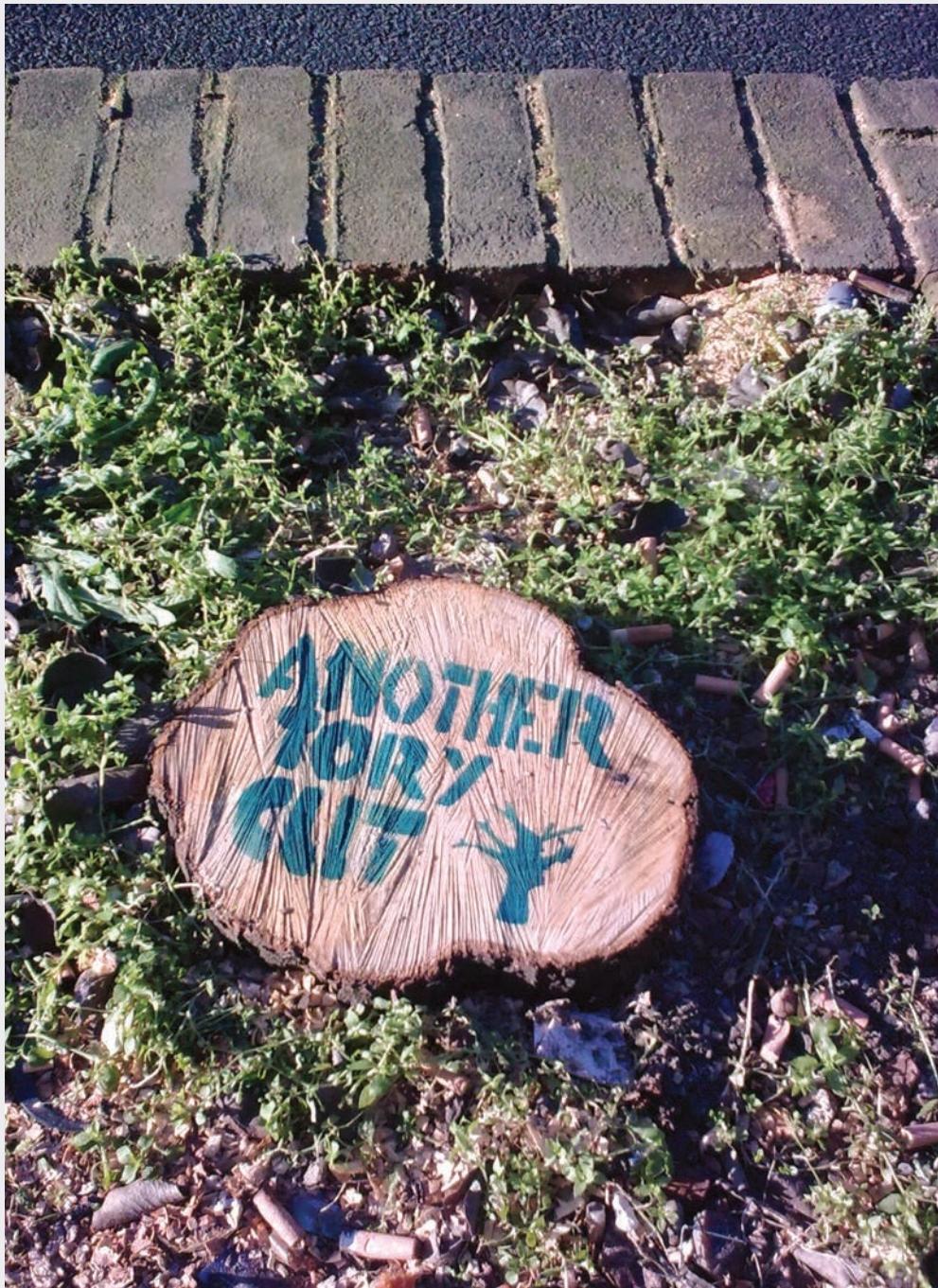
Photo credit: cathredfern, another tory cut: graffiti in Tower Hamlets 12/2010 THIS IMAGE IS LICENSED UNDER CREATIVE COMMONS (CC BY-NC 2.0).