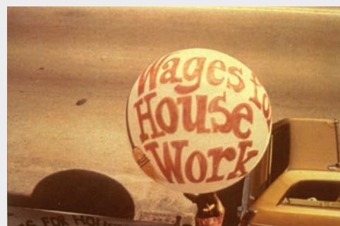
Wages for Housework. Photograph copy: Balloon. Celebrating the opening of NYC Wages for Housework office. Brooklyn, 288-B Eight Street. 15 November 1975. Deposited by Silvia Federici at MayDay Rooms, London, 29 January 2013. THIS IMAGE IS LICENSED UNDER CREATIVE COMMONS (CC BY-NC-SA 4.0).

What would a radical conception of collective care look like for our time? One that can transform the power relations that reinforce care inequalities? One that can withstand the imperative to align one's self-care needs with the demands of self-optimization in the service of financialized capitalism? One that offers a real alternative to the temptations of a new “caring capitalism” 8 or “compassionate” capitalism in which an entrepreneurial hand can find its ethical glove in “doing well by doing good,” 9 making money out of the efforts of communities to address their ongoing care crisis as they put their unpaid, volunteer labour to work in order to fill the gaps in existing welfare provision?