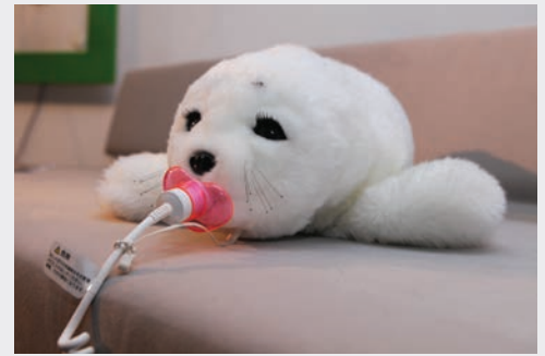
“Paro” by Japan's National Institute of Advanced Industrial Science and Technology (AIST) is an animal-like robot that has been in use in Japan and Europe since 2003 for therapeutic purposes—for example, providing care to people with Alzheimer's disease. Modeled on a baby seal, Paro registers environmental stimuli via two computers and five sensors that measure touch, light, sound, temperature and physical position. This enables it to interact with its human interlocutor. Paro is able to learn—it can recognize 50 different voices and responds to its name.” (Ars Electronica, “Paro,” 10 March 2011, https://www.flickr.com/photos/arselectronica/5514133373 .)