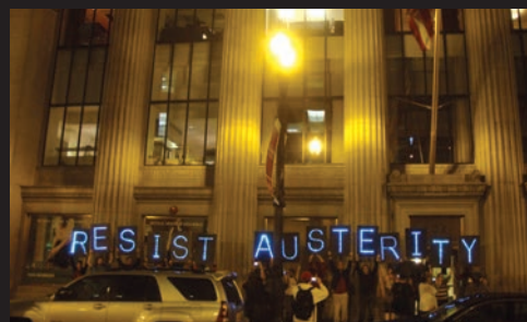
Joe Brusky, Resist Austerity

emotional needs of those within and outside the household. Against the sanitized view of caring as bliss, the material realities of care work are more complex. Despite some uncoupling of care from gender as a result of feminist struggles, the global burden of caring responsibilities still disproportionately falls on women’s shoulders—even as more women have entered the paid workforce. The market’s incursions into ever more areas of social life has entrenched a highly stratified care sector, where class, gender, race, and citizenship and migration status are intersecting determinants of who does the mostly underpaid, increasingly precarious, and frequently arduous work of tending to others.