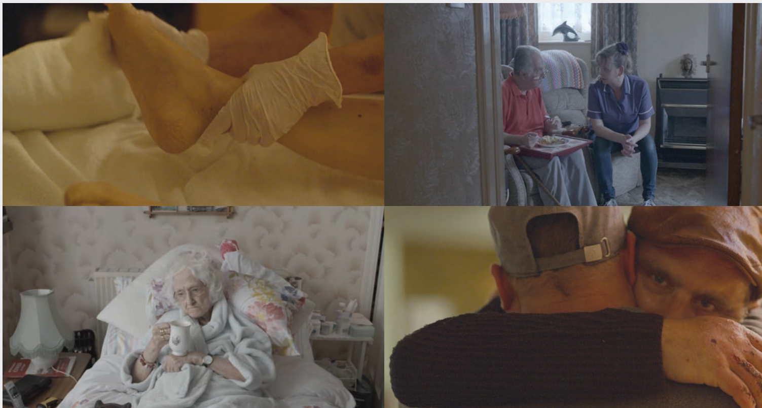
Steven Eastwood, Island (film stills), 2017. 92 minutes.

produced my camera the nurses would vacate the frame. We had a meeting with the nurses and said, “Listen, we are giving an inaccurate representation. If you see what I’m filming, it looks as though these people are abandoned.” That produced a powerful shift in the nurses’ attitudes. They understood that it was important to act against their default behaviour. They had to allow themselves to be visible.